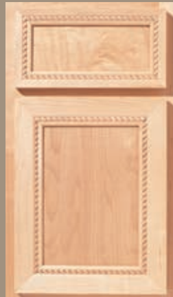
ST. MARTIN (natural maple)