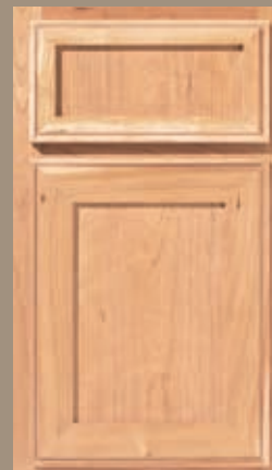
CAYMAN (natural cherry)