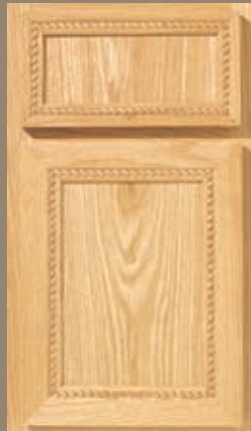
ST. JOHN (natural oak)