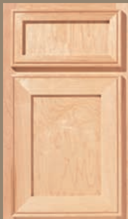
ANTIQUA (natural maple)