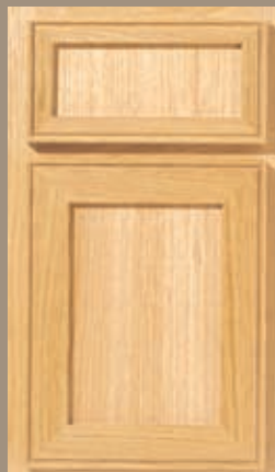
JAMAICA (natural oak)