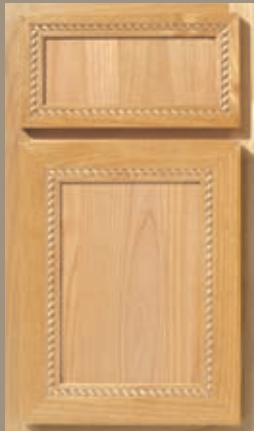
ST. THOMAS (natural alder)

Lanz is committed to providing top quality in design, materials and construction.