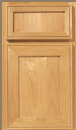
BAHAMA (natural alder)