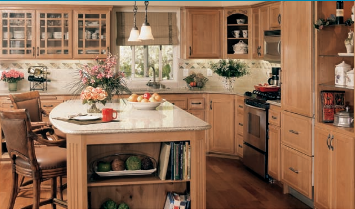
Signature Tradewinds with Antiqua doors

We designed our Tradewinds Collection with an island flair and premium hand-crafted, mitered five-piece drawer construction. Hand-applied rope molding adds definition to your kitchen and requires the highest skill level and attention to detail. Simple lines combined with decorative, beaded exterior lines can be breezy and casual or suited to a more formally appointed room.